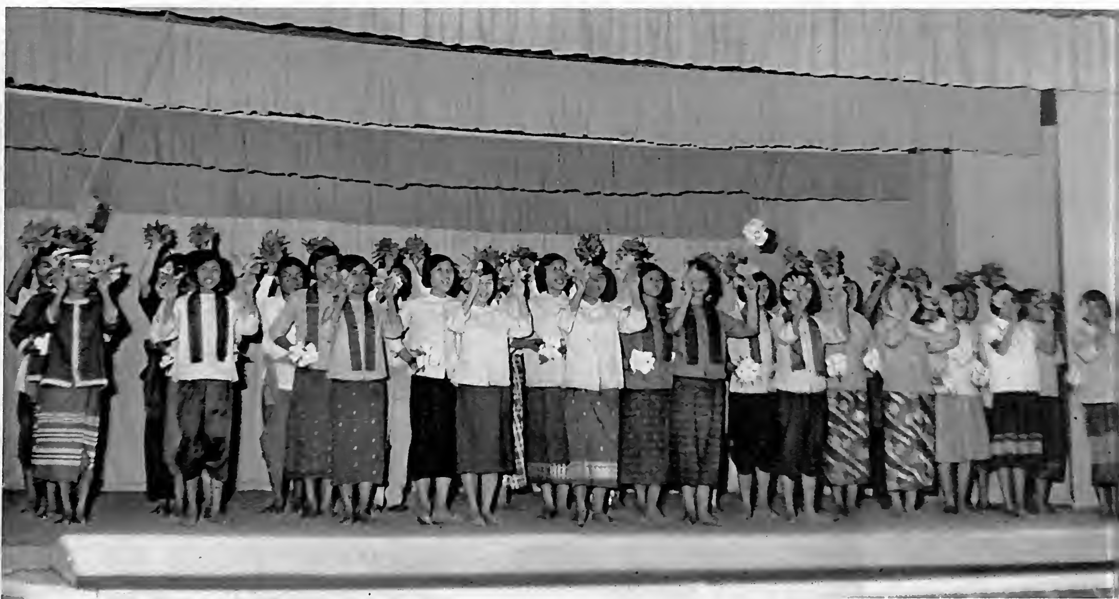
Artists paying tribute to the Head of State.